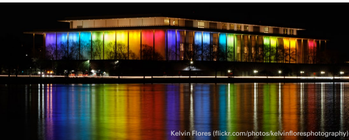
Kelvin Flores (flickr.com/photos/kelvinfloresphotography)