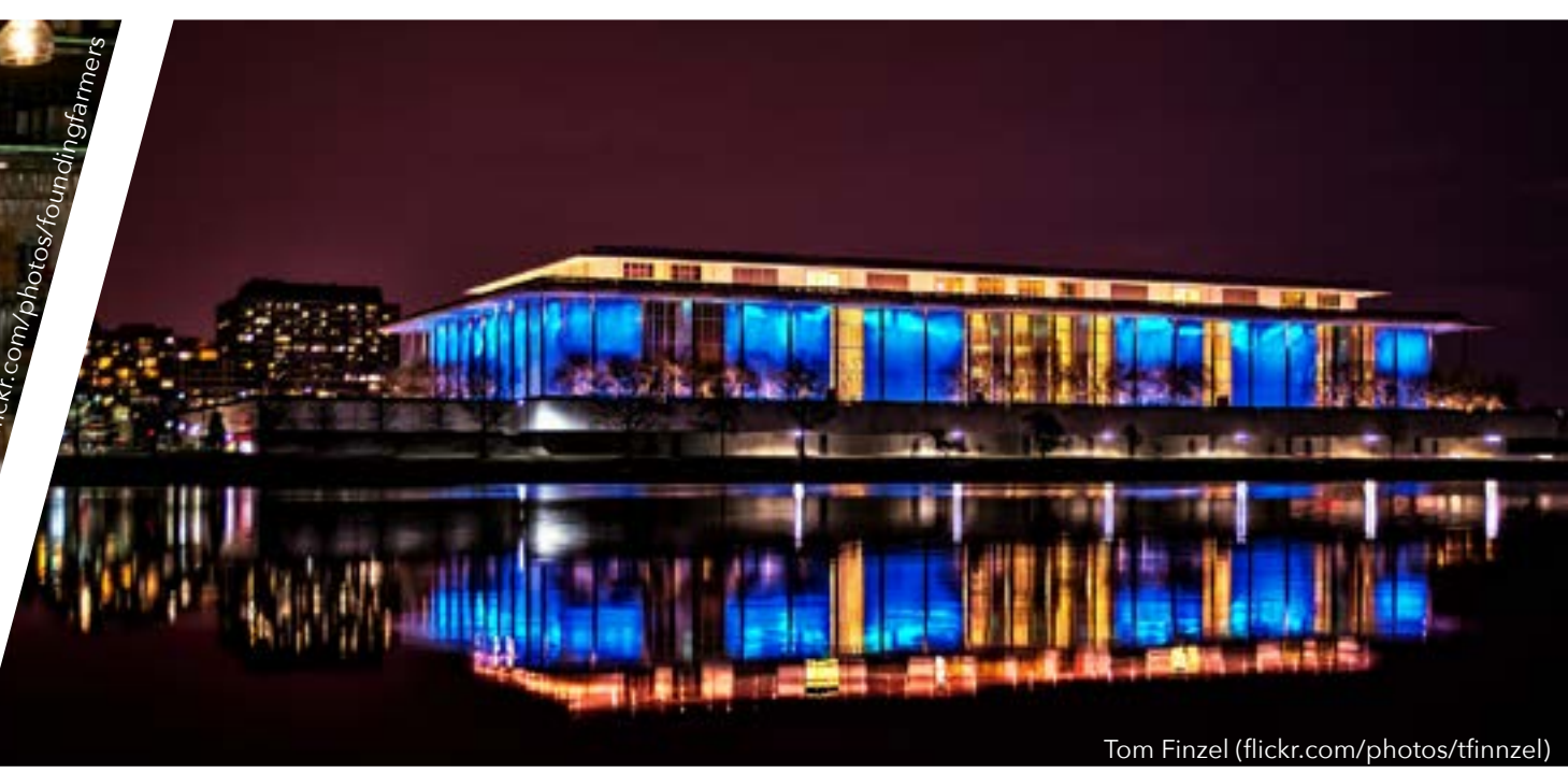
Tom Finzel (flickr.com/photos/tfinnz)