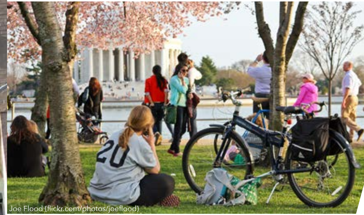
Joe Flood (flickr.com/photos/joeflood)